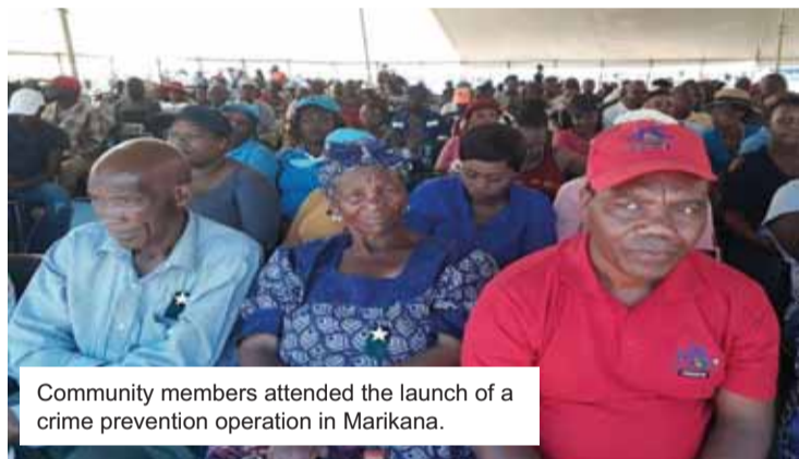
Community members attended the launch of a crime prevention operation in Marikana.

"The suspect was found in possession of a G4S bullet-resistant vest. In addition, a trailer of which the chassis number was tampered with, was seized at one of the three suspected chop shops police investigated during the operation," brigadier Mokgwabone added.